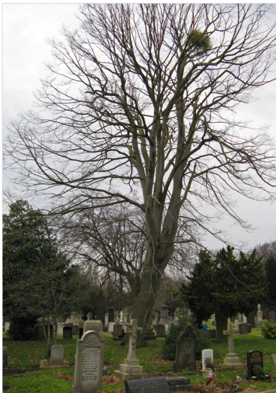
Clump of Mistletoe on Lime, Western Cemetery

Incidentally, according to correspondence I have had, it would seem that the rather unusual host Aesculus flava is commonly so in the south.