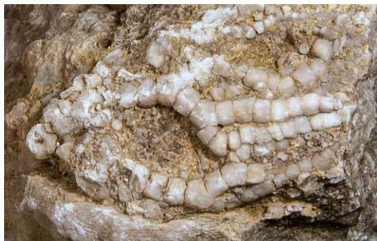
Fossil crinoids in limestone

Ludlow is very attractive and popular with tourists so had plenty of pubs and restaurants. However some COVID restrictions were still in force and at certain places a large group was not permitted but we managed to book a table at the Church Inn. As befitted its name,