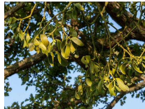
Mistletoe on Hawthorn in Lockington

seems generally to favour large, old and or decrepit trees, those most likely to be removed.