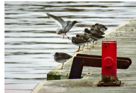
Figure 2: Examples of Redshank roost on the River Hull near Wilmington bridge, making use of the river hard defences. Note the presence of pellets and faeces around the roost site.

more sociable and gather in loose groups in a favoured, sheltered and undisturbed spot to roost (Figures 2, 4, 5, 6).