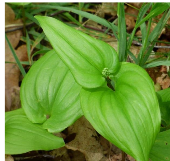
May Lily leaves and bud

confirmed by the many contemporary herbarium records. Between 1857 and 1887 many collectors descended on the area, some making multiple visits, digging up material not just for their own herbariums and gardens, but also to sell to private collectors, to exhibit or exchange at learned societies.