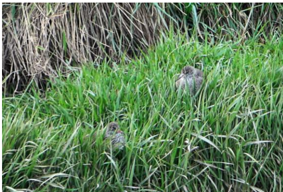
Figure 4: Redshanks roosting in riparian vegetation in the Stoneferry area

This area has been visited irregularly and not always at high tide, four times in 2020 and six times in 2021. We were informed by Nathan Pickering of the presence of a roost at the Croda berth between 1999 and 2004 of up to 45 individuals. Five individuals were found roosting at the flood defence wall by the scrapyard (OS grid reference TA 0980 3173) on 13/4/2021 at a very high tide.