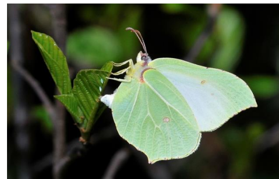
Brimstone female egg laying

The best spring flowering plants for bees and butterflies are native species and a lot depends how far you can let go of being 'tidy'. Herb-Robert, Garlic Mustard, Red Campion, Hedge Woundwort and more, can run riot in the garden. Some areas can look quite 'messy' by August, but it's all worth it.