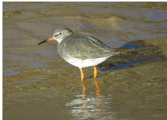
Figure 1: Redshank in winter plumage feeding in the Museums Quarter

the five-year population average is 2881 individuals, constituting a population of international importance (Woodward et al., 2019; Frost et al., 2021). However, since the baseline winter (1998/1999), the Humber population has declined by 54%, which has triggered a high alert for the site (Woodward et al., 2019).