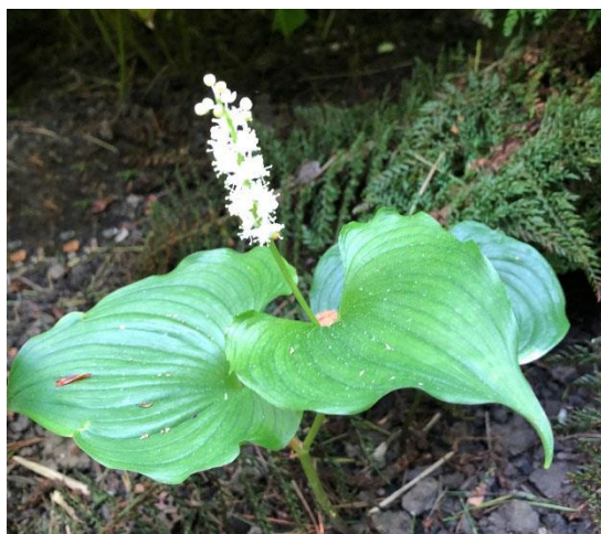
May Lily in cultivation