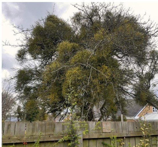
‘Mistletoe Tree’ — apple, Beverley

Apples here are laden with large Mistletoes. From here the colony has spread, most conspicuously and quite prolifically to the tall Limes behind Beverley High School. A nearby Poplar, in the opposite direction, was also infested by several clumps until recently felled for no obvious reason. In nearby gardens, Rowan ( Sorbus aucuparia ) is also infected. An outlying clump grows on a Lime at the old County Hall building.