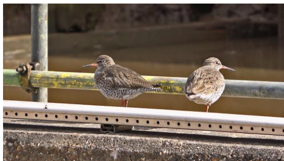
Figure 5: Redshanks roosting next to Wilmington Bridge by temporary scaffolding during repair works

The bulk of Redshank records in the city in the last couple of decades, from October to April, indicate the presence of a wintering, rather than breeding, population.