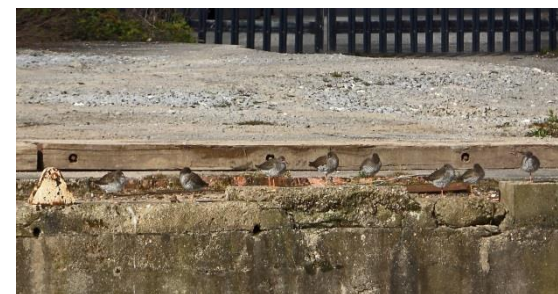
Figure 6: Redshanks roosting between Drypool Bridge and North Bridge

For any necessary development causing habitat loss there should be compensatory actions such as managed realignment to create or allow the natural development of new mud banks.